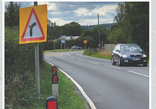
Poor visibility both ways at Stilebridge junction where B2079 joins A229