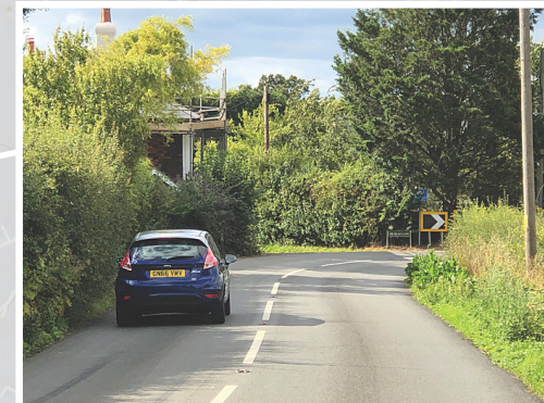
Blind corner on Maidstone Road at junction with Milebush Lane