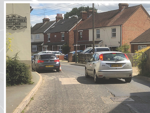
Constricted point on Howland Road (route to Staplehurst) with pavement one side only and just 0.30m wide