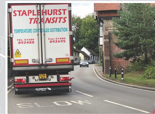
Narrow point of A229 on approach to Linton crossroads (route into Maidstone and to M20)