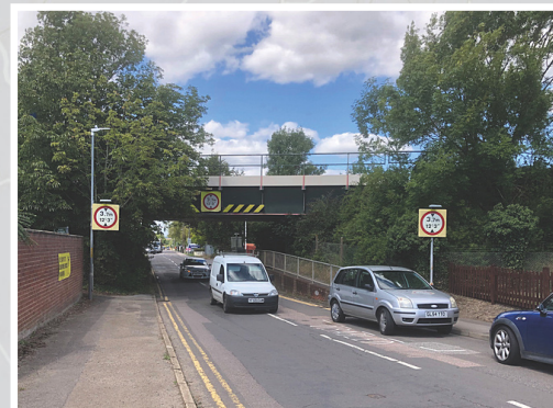
Low railway bridge (3.7m) on Pattenden Lane with pavement one side only