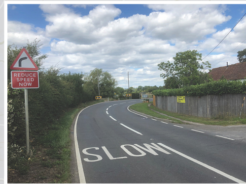
Poor visibility at proposed Transport Hub/school access at Church Farm (adjacent to Grade II listed buildings)