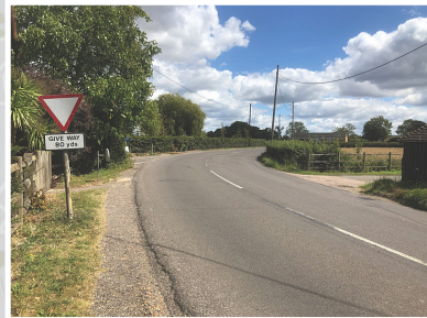
Poor visibility near junction, Underlyn Ln