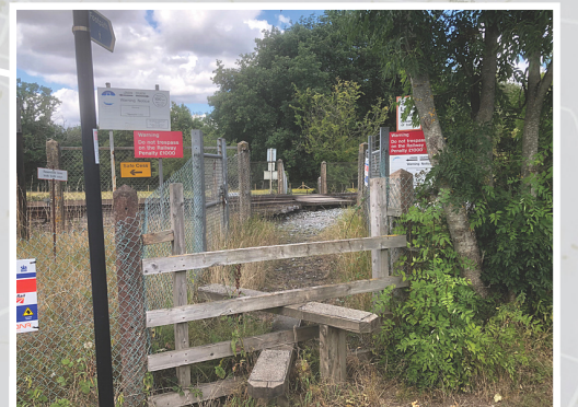
Unprotected railway crossing on Howland Road (marked 'existing footbridge' on developer's plans) will be a desire line for eastern area of site