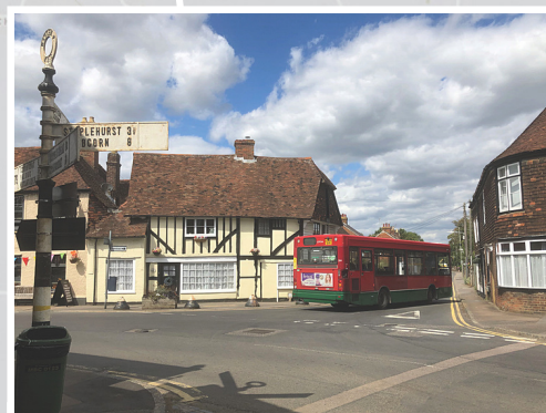
High St/Maidstone Rd junction (adjacent to listed buildings) is narrow - HGVs often cannot manage it in one manoeuvre