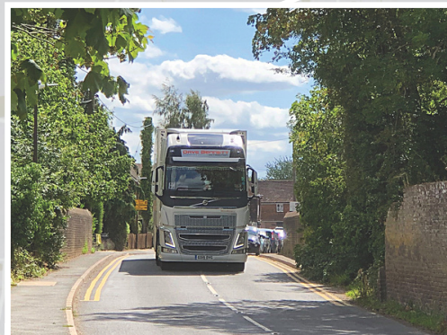
Narrow rail bridge on Maidstone Road (only N-S route through the village avoiding low bridge) with paths of 0.9m and 0.7m