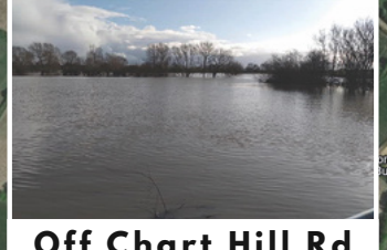
Off Chart Hill Rd