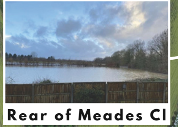
Rear of Meades Cl